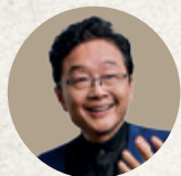
指挥 | 葉聰 CONDUCTOR TSUNG YEH