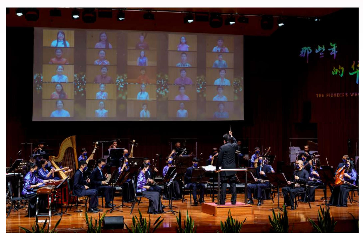
▲ 声乐联盟室内合唱团 Vocal Associates Chamber Choir