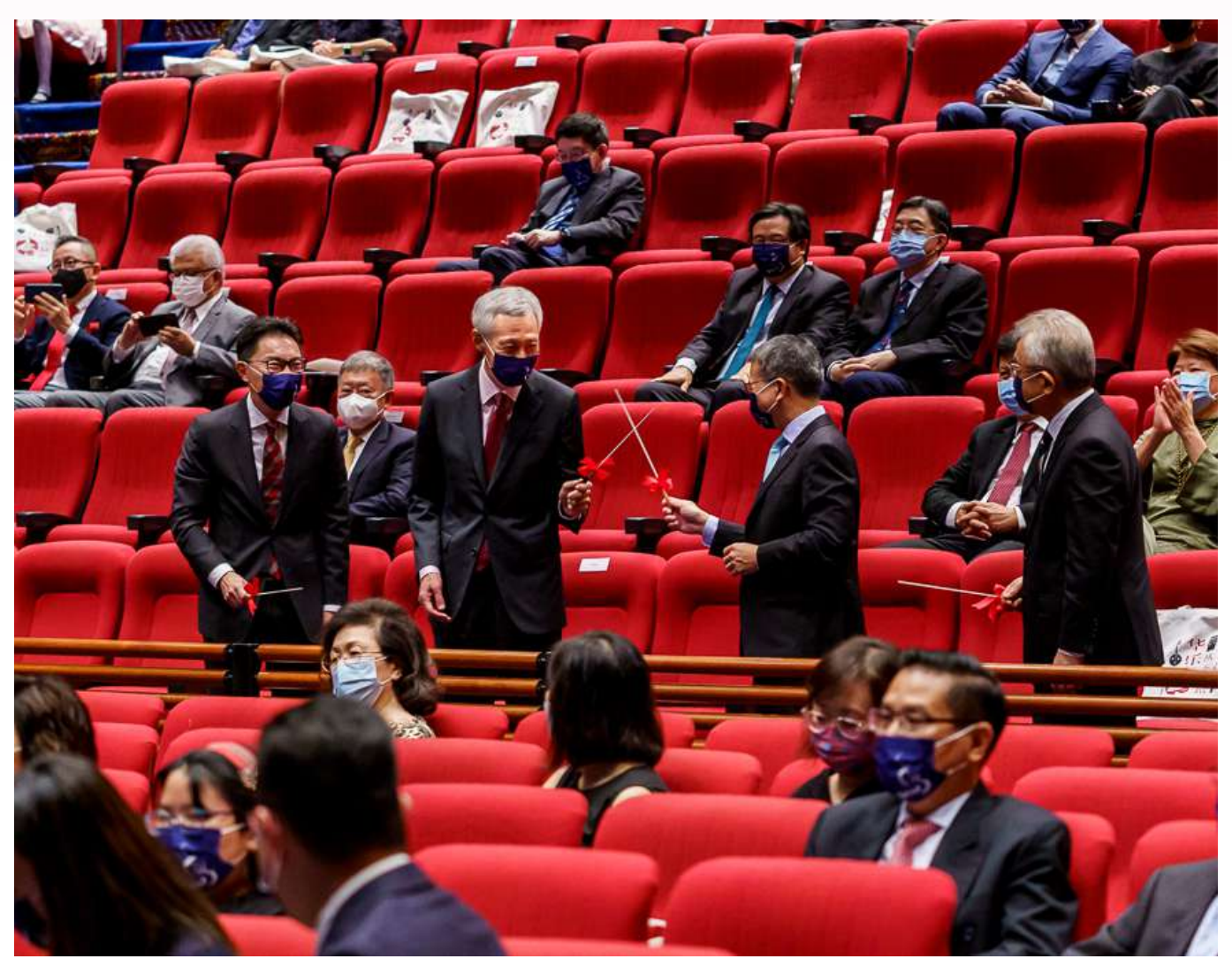
总理李显龙与部长唐振辉主持了新加坡华乐团纪念特刊的发布仪式 Prime Minister Lee Hsien Loong and Minister Edwin Tong hosted SCO's commemorative book launch

李显龙总理也为乐团的纪念特刊主持了发布仪式。此纪念特刊 名为《名家·华韵》,并收录了乐团八位演奏家从未公开的故事。 特刊共分为两版,英文版由前《海峡时报》资深记者梁荣锦执 笔,中文版则由《联合早报》特约评论员严孟达,带领报业控股 华文报编辑团队撰写。