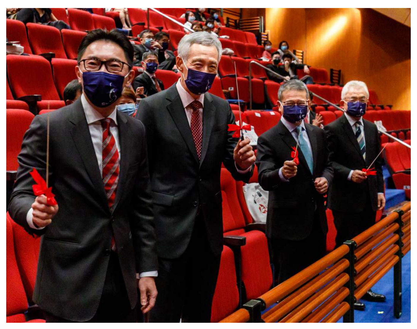
主宾李显龙总理及特别嘉宾文化、社区及青年部长兼律政部第二部长唐振辉 Guest-of-Honour Prime Minister Lee Hsien Loong and Special Guest Minister for Culture, Community and Youth & Second Minister for Law Edwin Tong

今年是新加坡华乐团成立的第25周年,为了庆祝这别具意义的 日子,乐团于2021年10月8日举办了《炫彩》庆典音乐会。我们 很荣幸地邀请到乐团赞助人李显龙总理莅临现场,担任音乐会 主宾。另外,文化、社区及青年部长兼律政部第二部长唐振辉也 是音乐会的特别嘉宾。