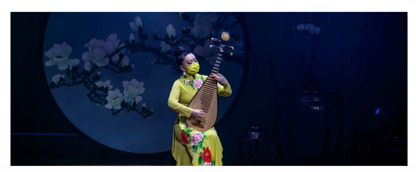
▲ 琵琶首席俞嘉演奏《寒鸦戏水》 及《陈隋》 Pipa Principal Yu Jia performed Winter Crows Frolicking in the Water and Sounds from the Chen and Sui Dynasties