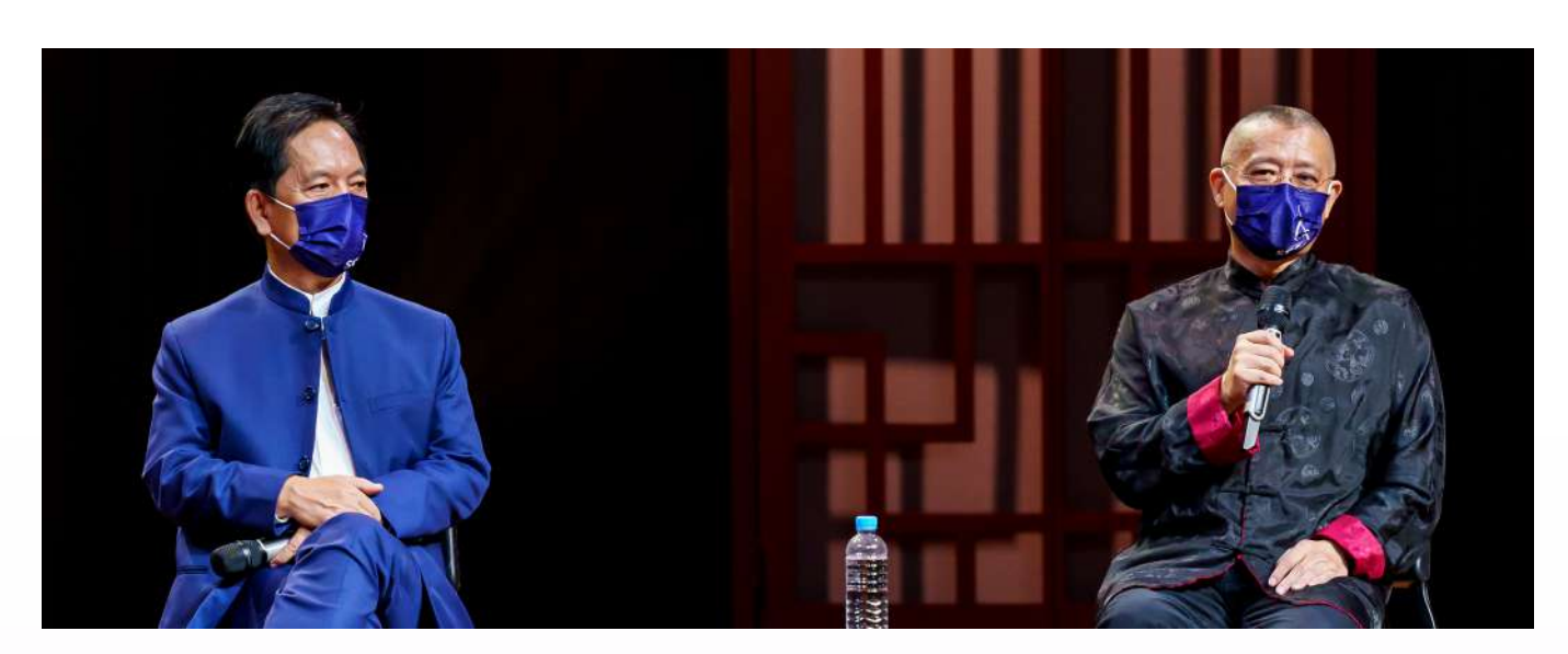
▲ 音乐会后分享会 Post-concert dialogue