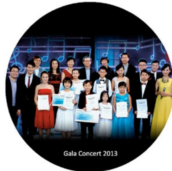
Gala Concert 2013