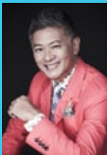
演唱: 李迪文 Vocal: Dick Lee